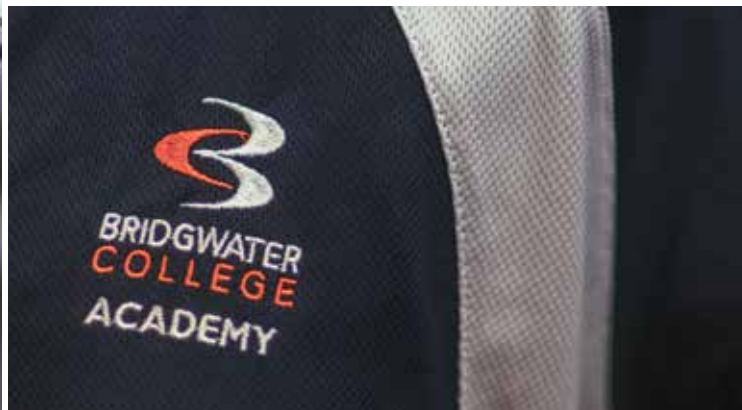
SPORTS & LEISUREWEAR