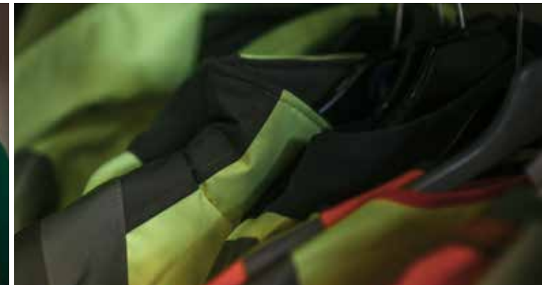
CLUBS & TEAMS