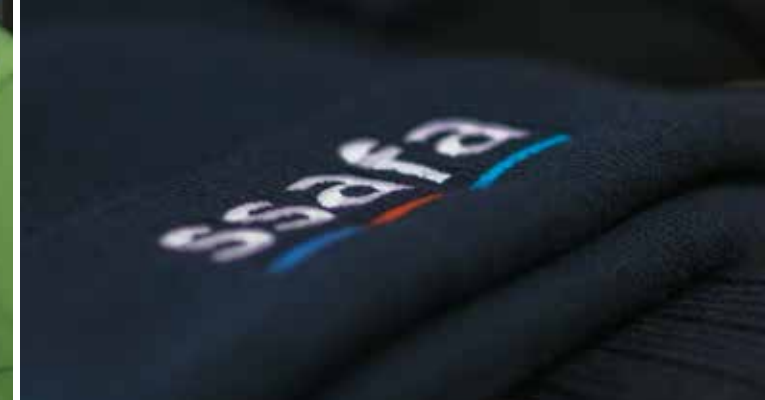
CORPORATE & BUSINESSWEAR