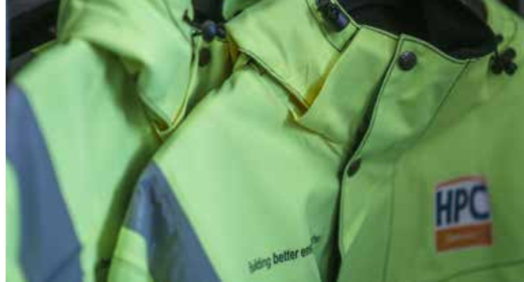
WORKWEAR & PPE

All of the above is available with personalised embroidery, print and tagging to deliver an image to be proud of.