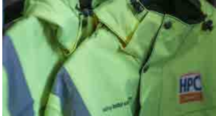
WORKWEAR & PPE

All of the above is available with personalised embroidery, print and tagging to deliver an image to be proud of.