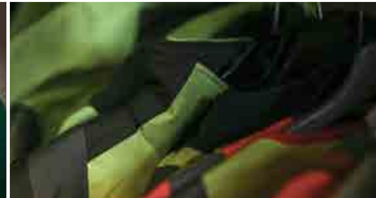
CLUBS & TEAMS