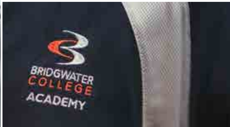
SPORTS & LEISUREWEAR