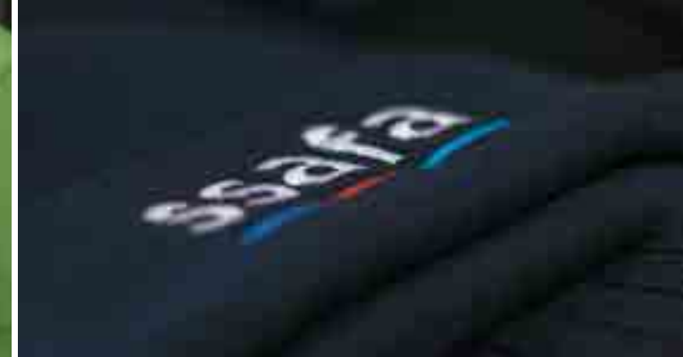
CORPORATE & BUSINESSWEAR