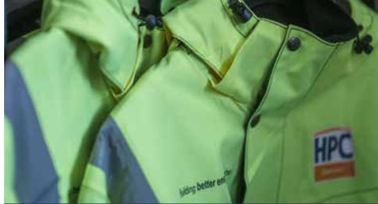
WORKWEAR & PPE

All of the above is available with personalised embroidery, print and tagging to deliver an image to be proud of.